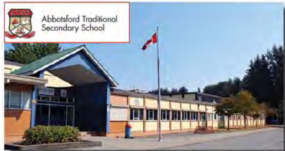
Abbotsford Traditional Secondary School

atss.abbyschools.ca Grades: 9 to 12 500 students 5 International Students